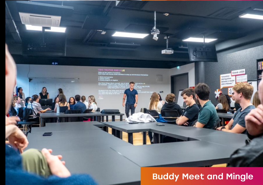
Buddy Meet and Mingle