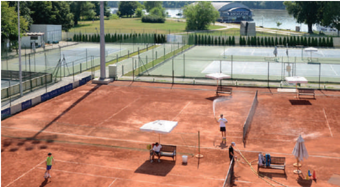
📍 Novak tennis centre