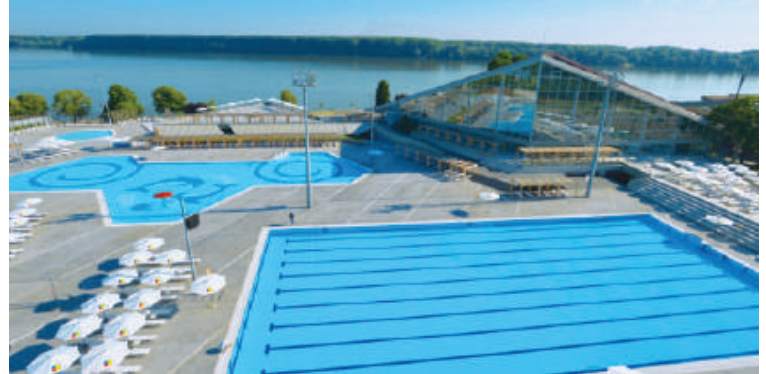
📍 Sports and recreation centre "Milan Gale Muskatirovic"